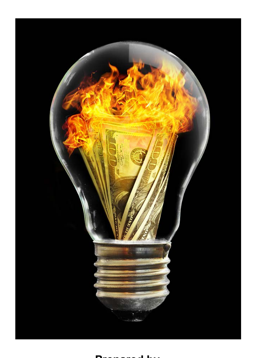
Prepared by Renewable Taos, Inc.